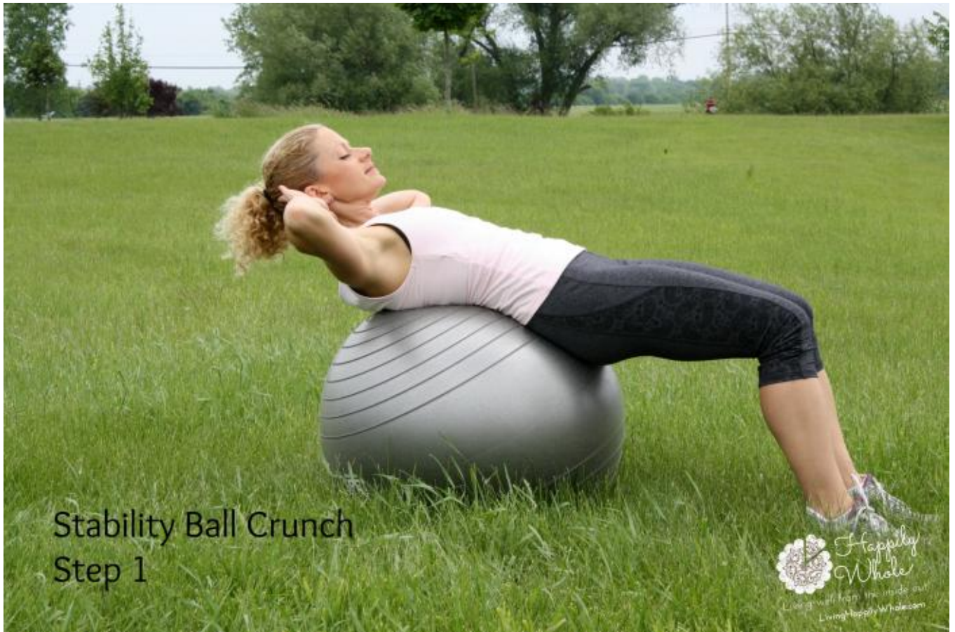
Stability Ball Crunch