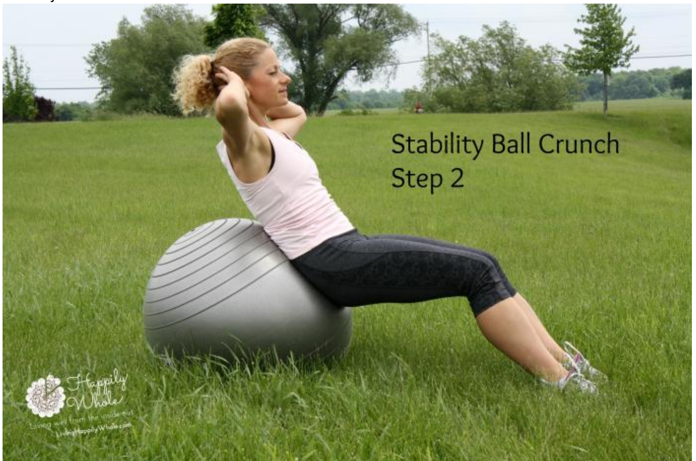
Stability Ball Crunch-2