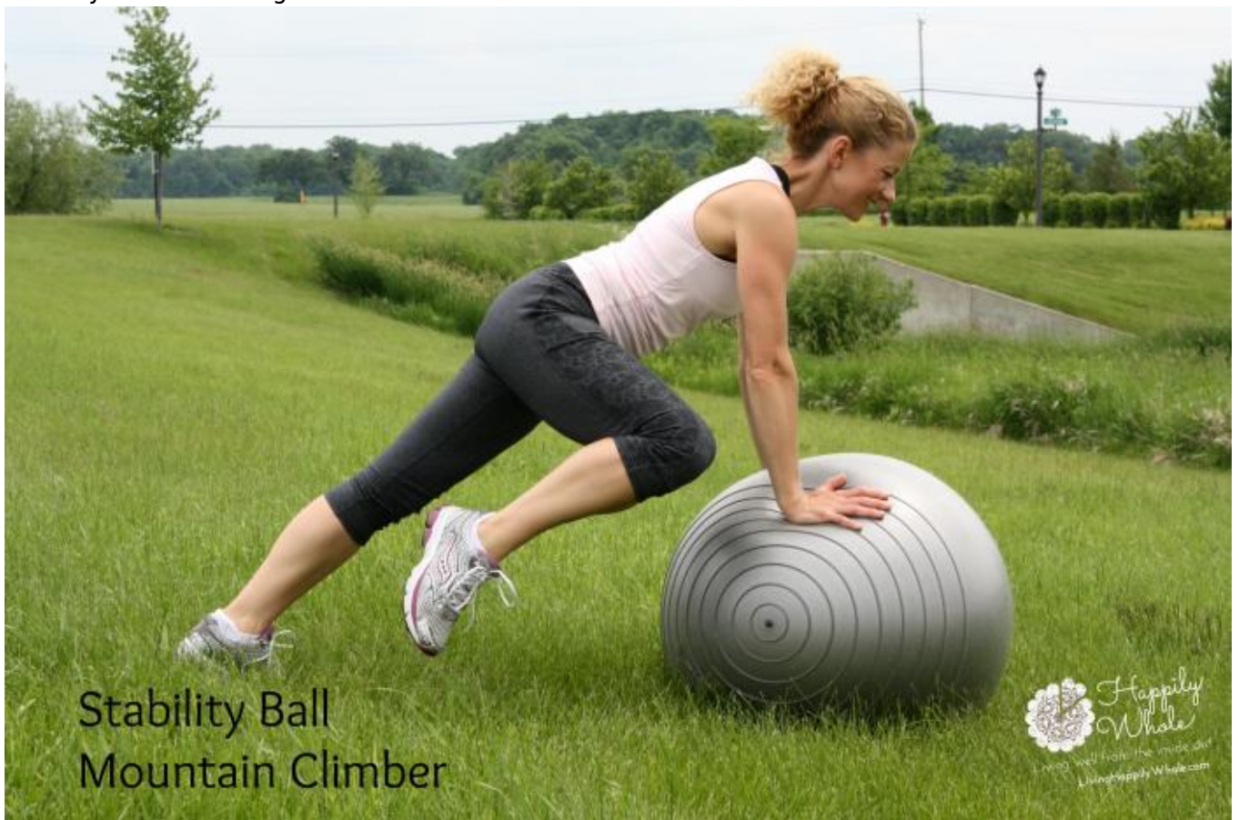
Stability Ball Mountain Climber