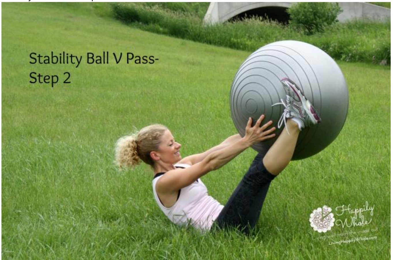
Stability Ball V Pass Step 2