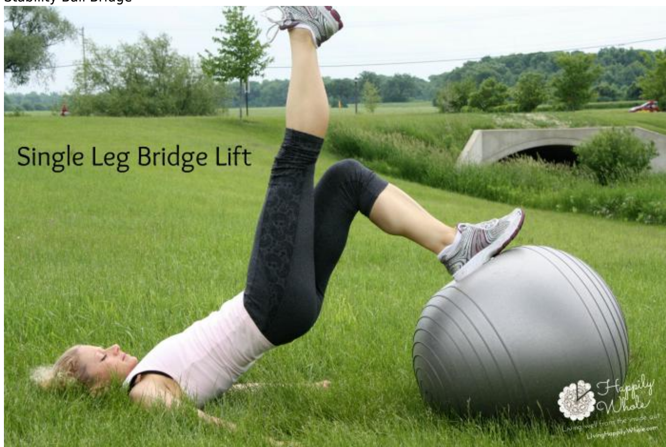
Stability Ball OPTIONAL single leg bridge