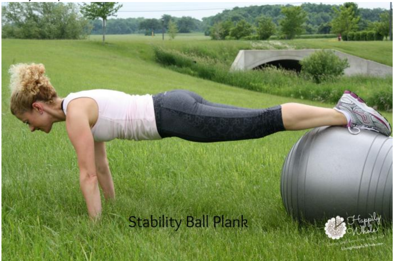
Stability Ball Plank