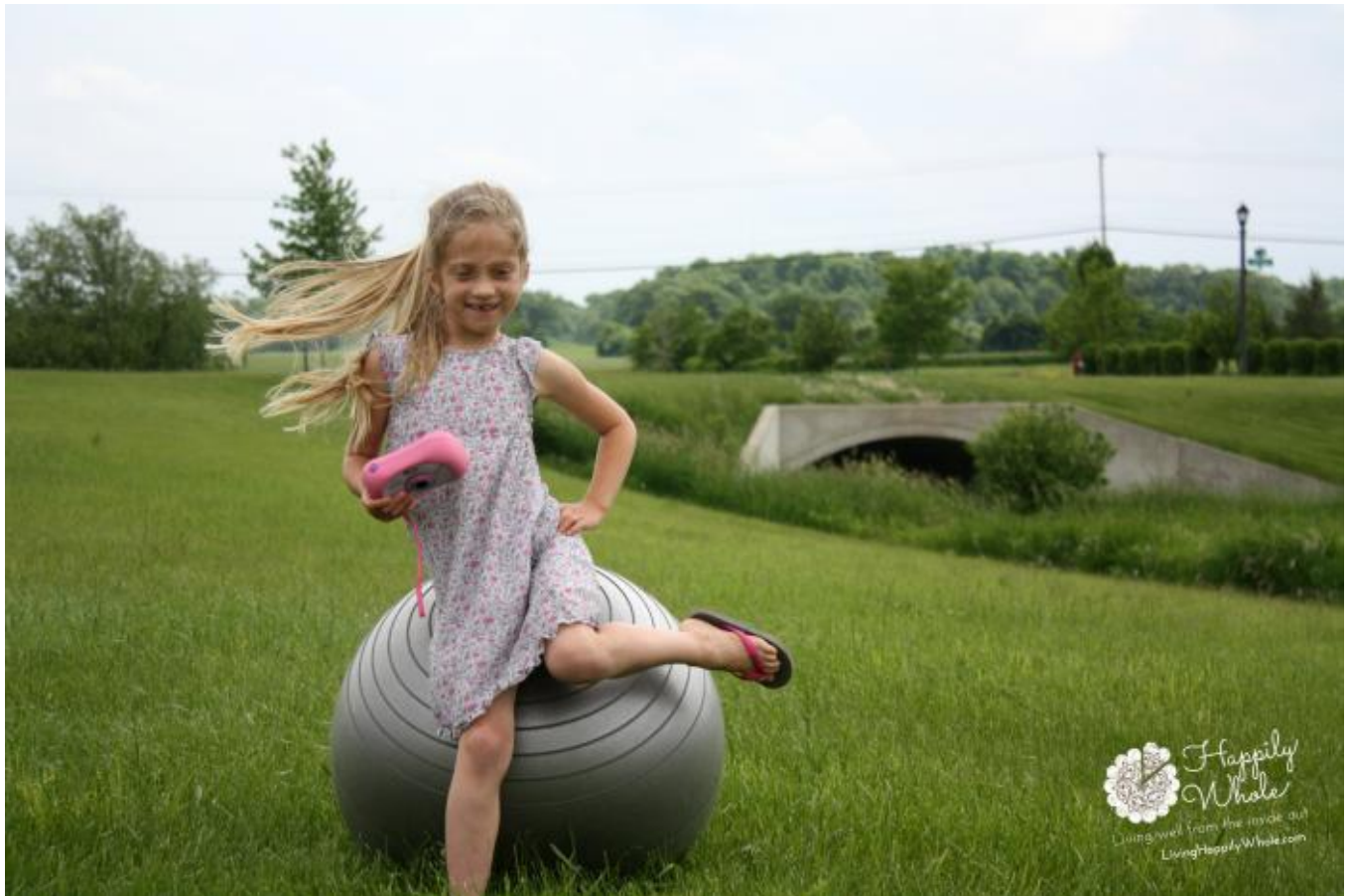
My Best Stability Ball Buddy