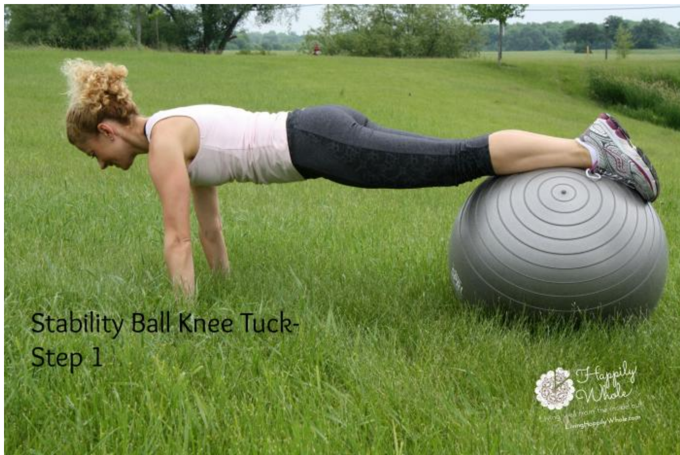
Stability Ball Knee Tuck 1