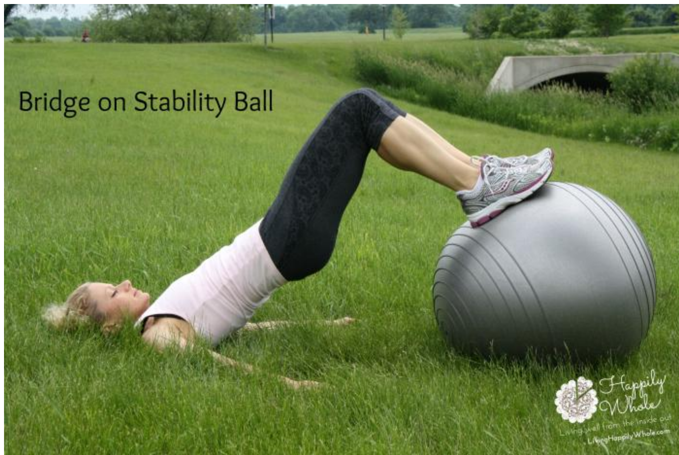
Stability Ball Bridge