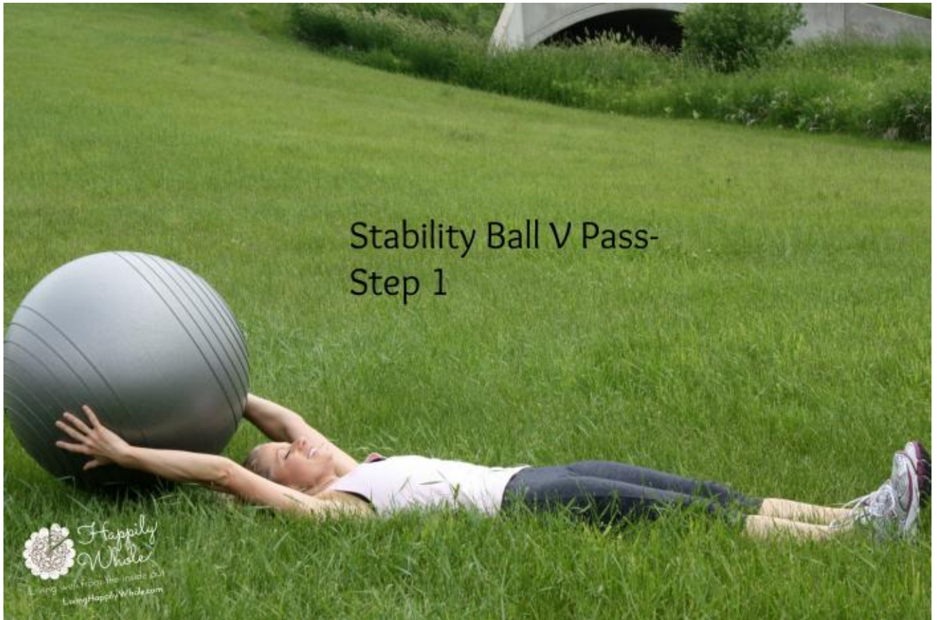
Stability Ball V Pass Step 1