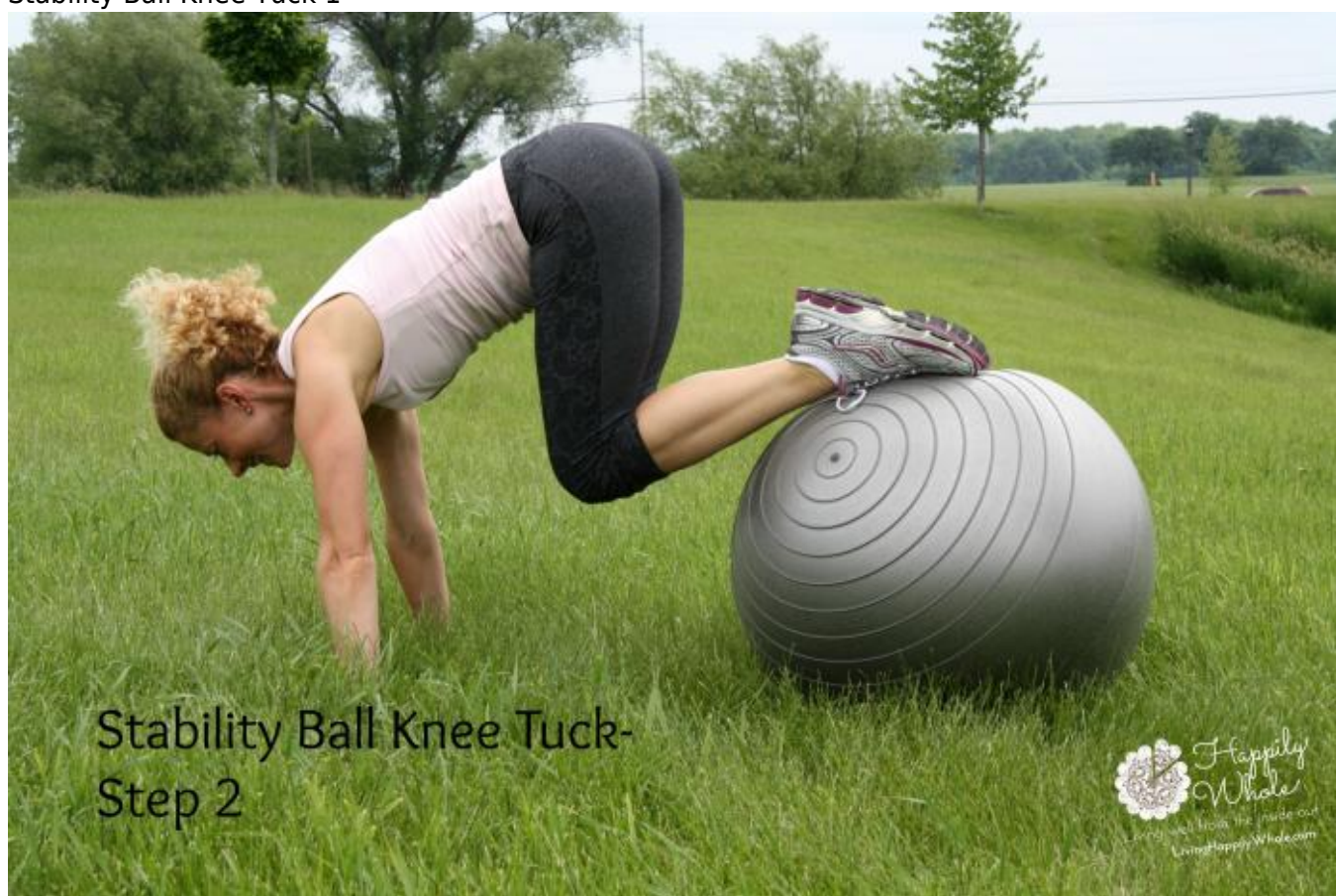
Stability Ball Knee Tuck 2