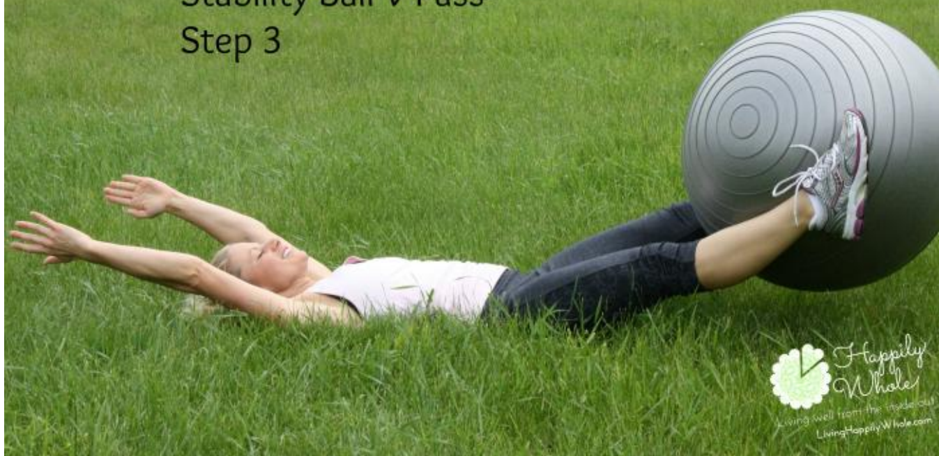
Stability Ball V Pass Step 3