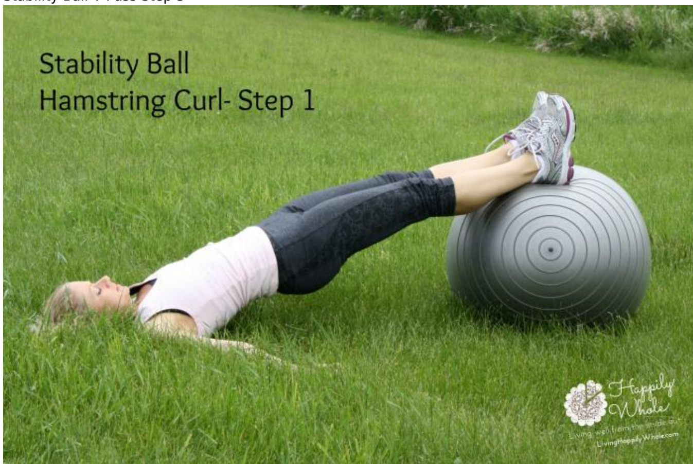
Stability Ball Hamstring Curl-1