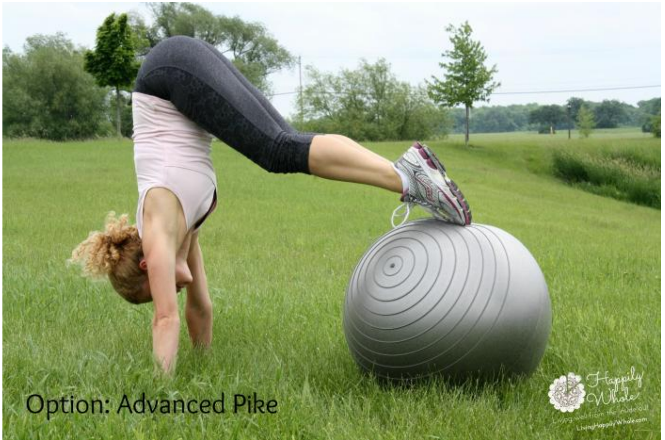
Stability Ball Optional Advanced Pike